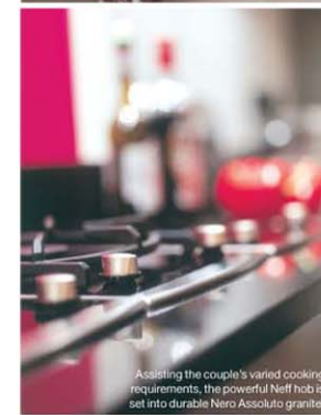
Assisting the couple's varied cooking requirements, the powerful Neff hob is set into durable Nero Assoluto granite.