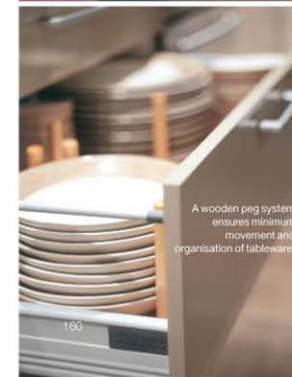
A wooden peg system ensures minimum movement and organisation of tableware.